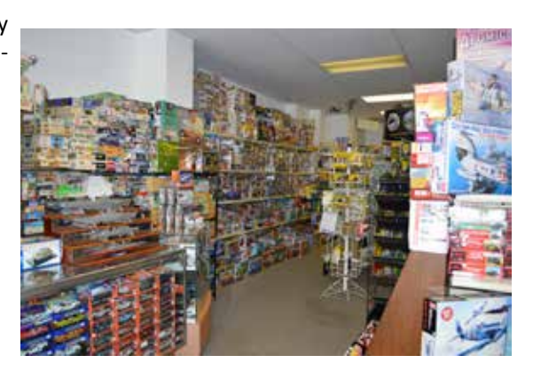
Looking at the rolling stock shelves you'll find a great selection of all types of car kits. Track supplies in all scales are also stocked.

Stewart's Hobbies also has many structure kits and has a really good selection o Campbell Scale models wood kits. Many would be hard to find elsewhere.